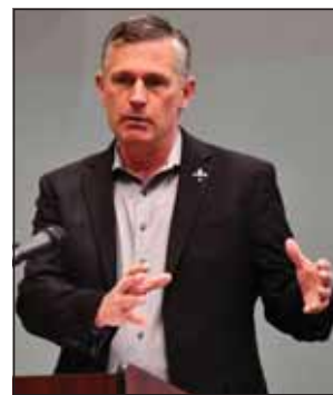
Sen. Martin Heinrich

14 attempts to fund the TSA, FEMA, CISA, and Coast Guard, but Senate Republicans blocked every effort. Heinrich has stated that he will not fund DHS' immigration enforcement efforts without any commonsense reforms to address lawlessness by the U.S. Immigration and Customs Enforcement. "From the start,